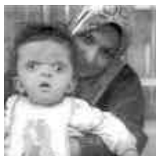
Birth Defect In Iraq Child Caused By Depleted Uranium Radiation