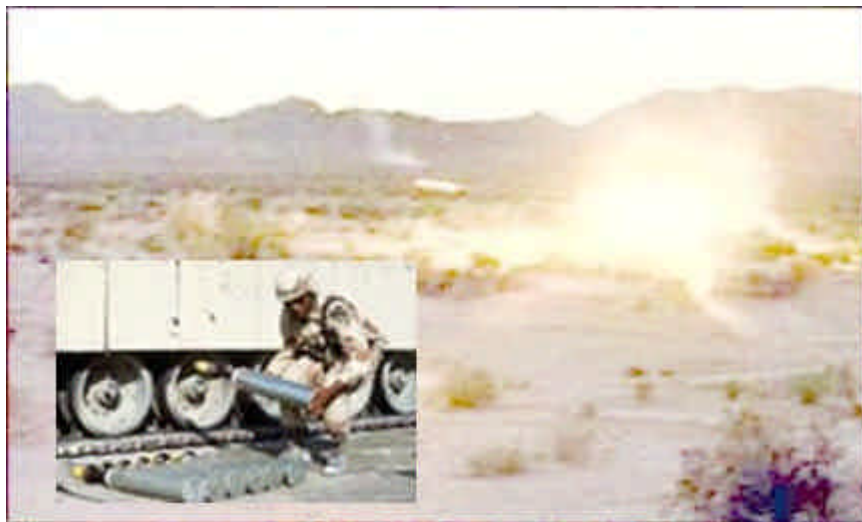
Use of Depleted Uranium Shells